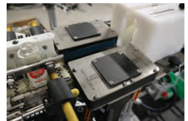
Belt drive for enhanced control.