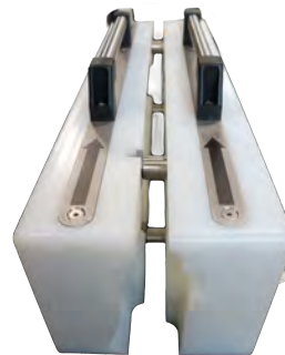
Modular design for easy washdown.