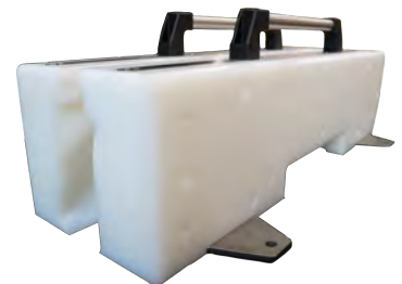
360° Inversion with dust clean out.