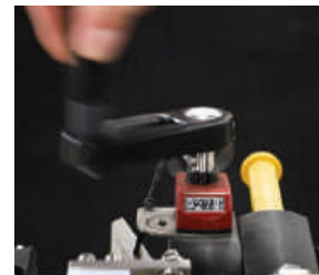
Precise numerical display and smooth, easy crank handle

Proven Performance in Every Packaging Changeover