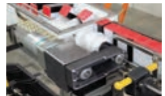
Single AC Motor Drive