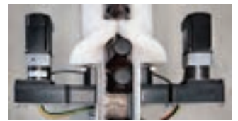
Dual Servo synchronization