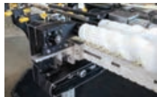
Dual AC Motor Drive

Container Sizes: Vials to 5-gallon containers