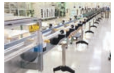
Automated Guide Rail Adjustment systems are ideal solutions when compliance is paramount.