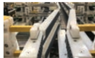
Automated Conveyor Y gate.