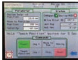
Real-time machine and changeover information.