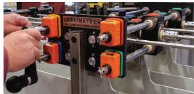
Numerical displays and color-coding provide confirmation of settings.