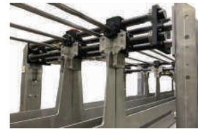
Robust components maintain position during back pressure.