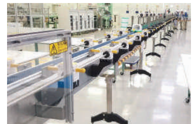
Automated Guide Rail Adjustment systems are ideal solutions when compliance is paramount.