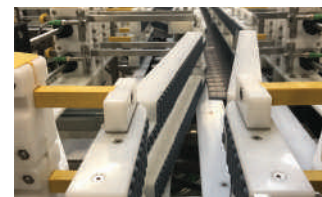
Automated Conveyor Y gate.