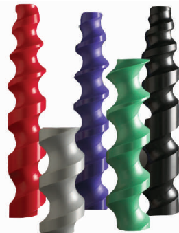
Color-coded for easy identification