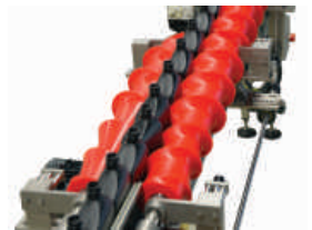
Programmable container infeed.